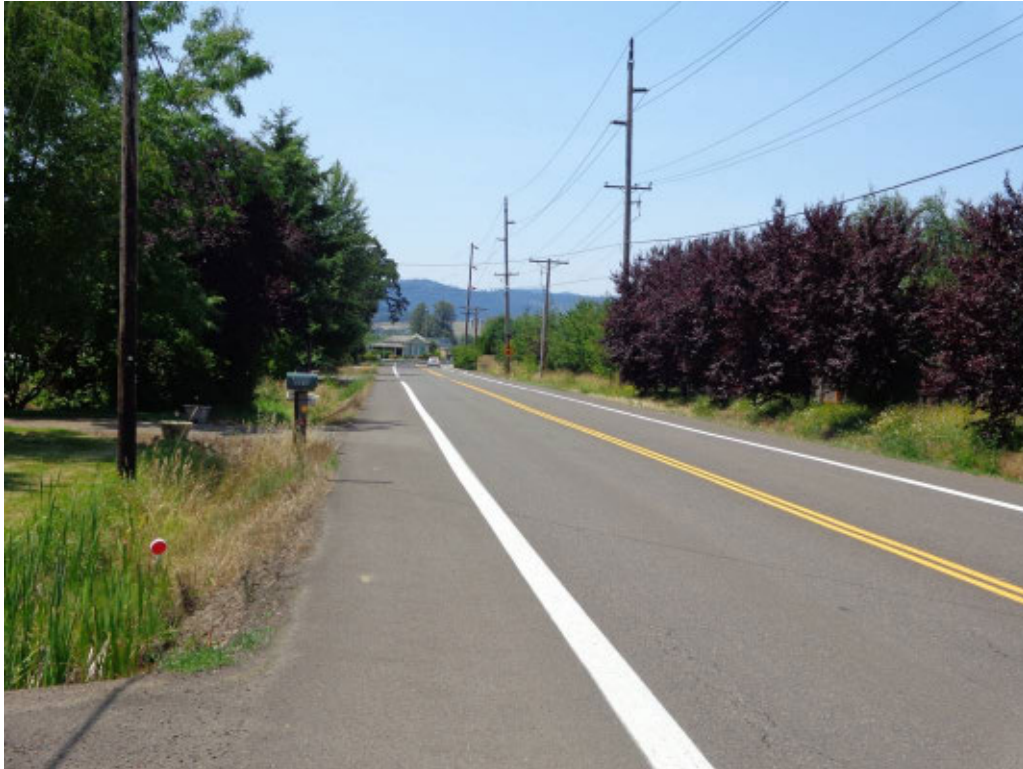
Figure 4. View to west of ditches along Gibson Hill Road near west end of project area.