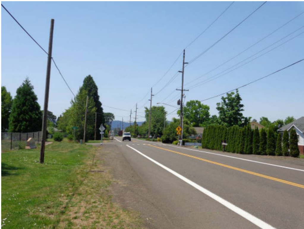
Figure 5. View to west where culverts along Gibson Hill Road have been covered.