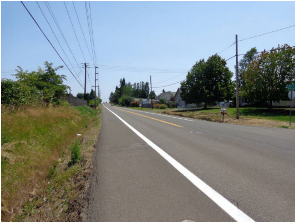
Figure 3. View to East of ditches along north side of Gibson Hill Road.