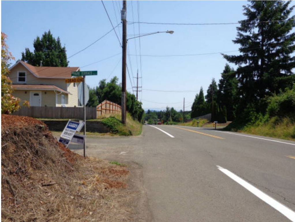
Figure 6. View to East where cutbanks occur along sides of Gibson Hill Road.