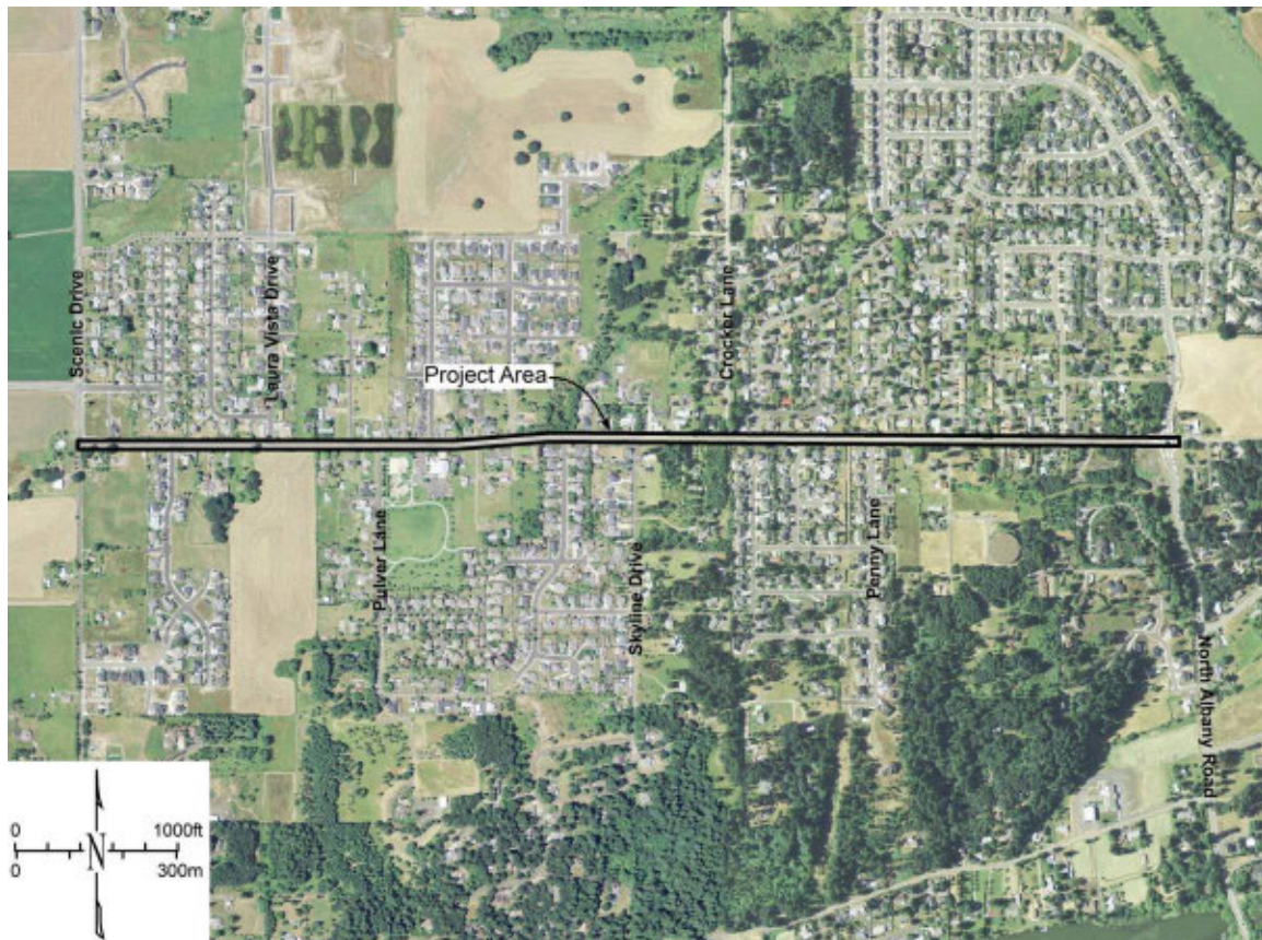
Figure 2. Location of the Gibson Hill Road project area on 2009 aerial photograph.

multi-use paths to adjoining neighborhoods characterized as single family residential (Figure 2). All work can be within the existing City ROW. No detour route is proposed, but single lane closures in sections are likely during sidewalk construction.