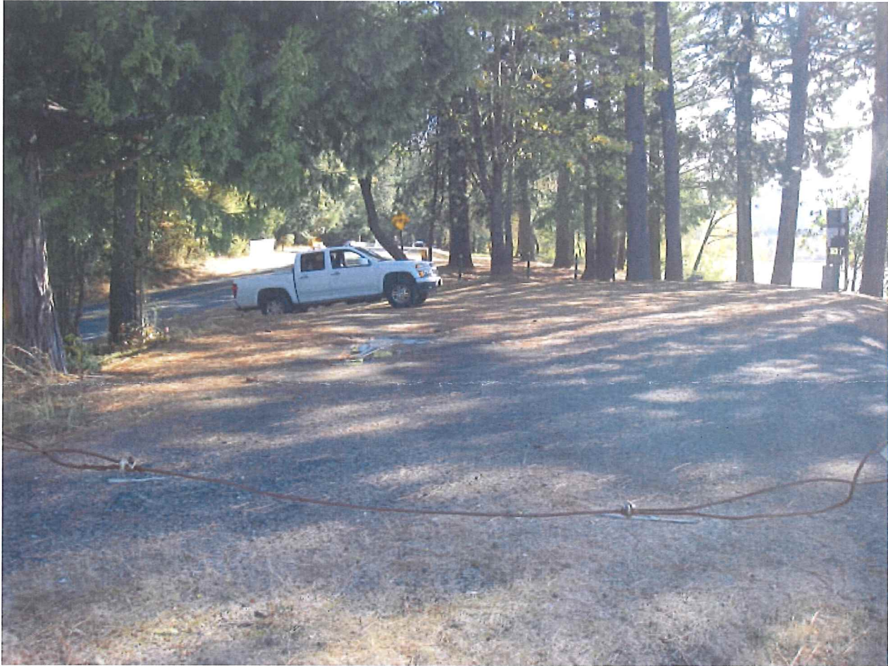
Figure 3. Gravel day use parking lot adjacent to Lake Selmac Spillway Bridge.

According to 23 CFR 774.13 and the FHWA Section 4(f) Policy Paper, temporary occupancy of park property does not constitute a use of Section 4(f) resources if all of the conditions set forth in 23 CFR 774.13(d) are met. Those conditions, and the measures that will be taken to meet those conditions, are described below: