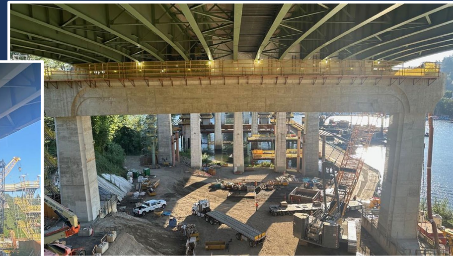
Crossbeam Falsework Pier 8