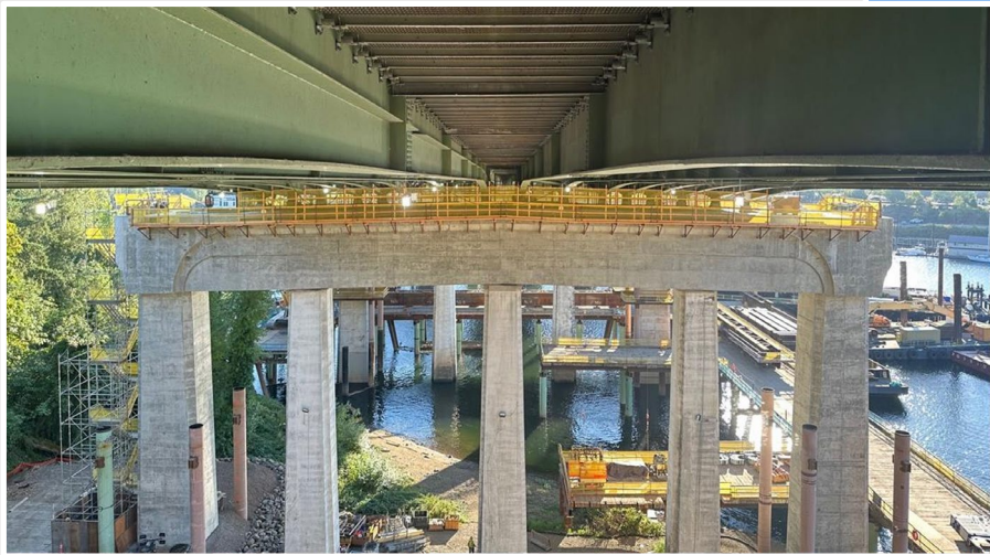
Crossbeam Falsework Pier 7