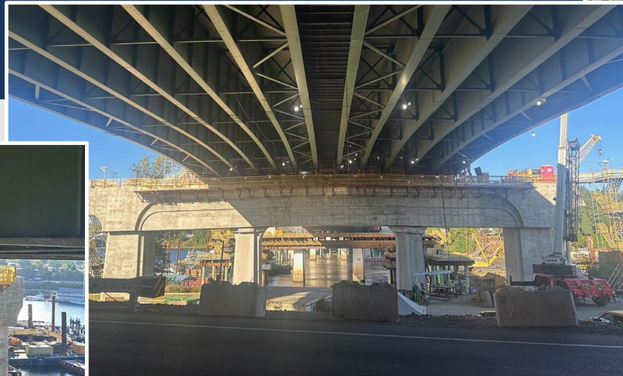
Progress at Pier 3