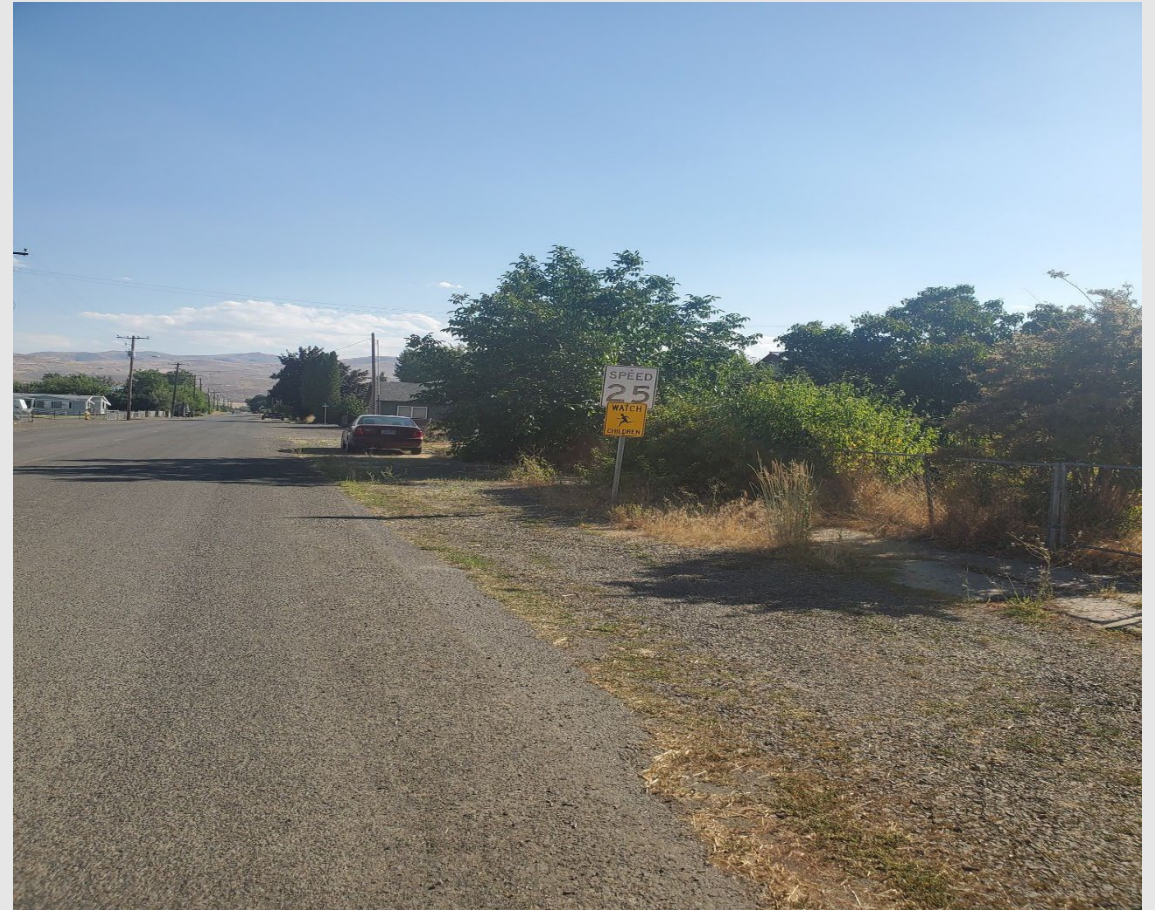
Richland, Population 166.