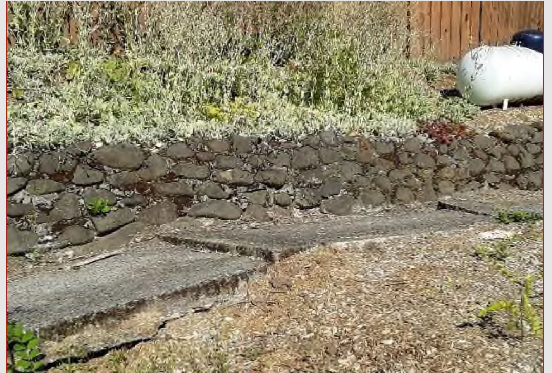
Gaston. Population 672.