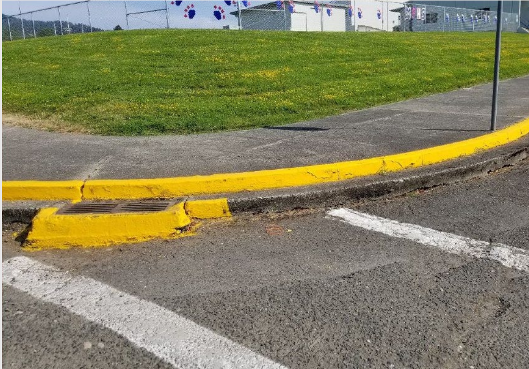
Myrtle Point. Population 2,479.