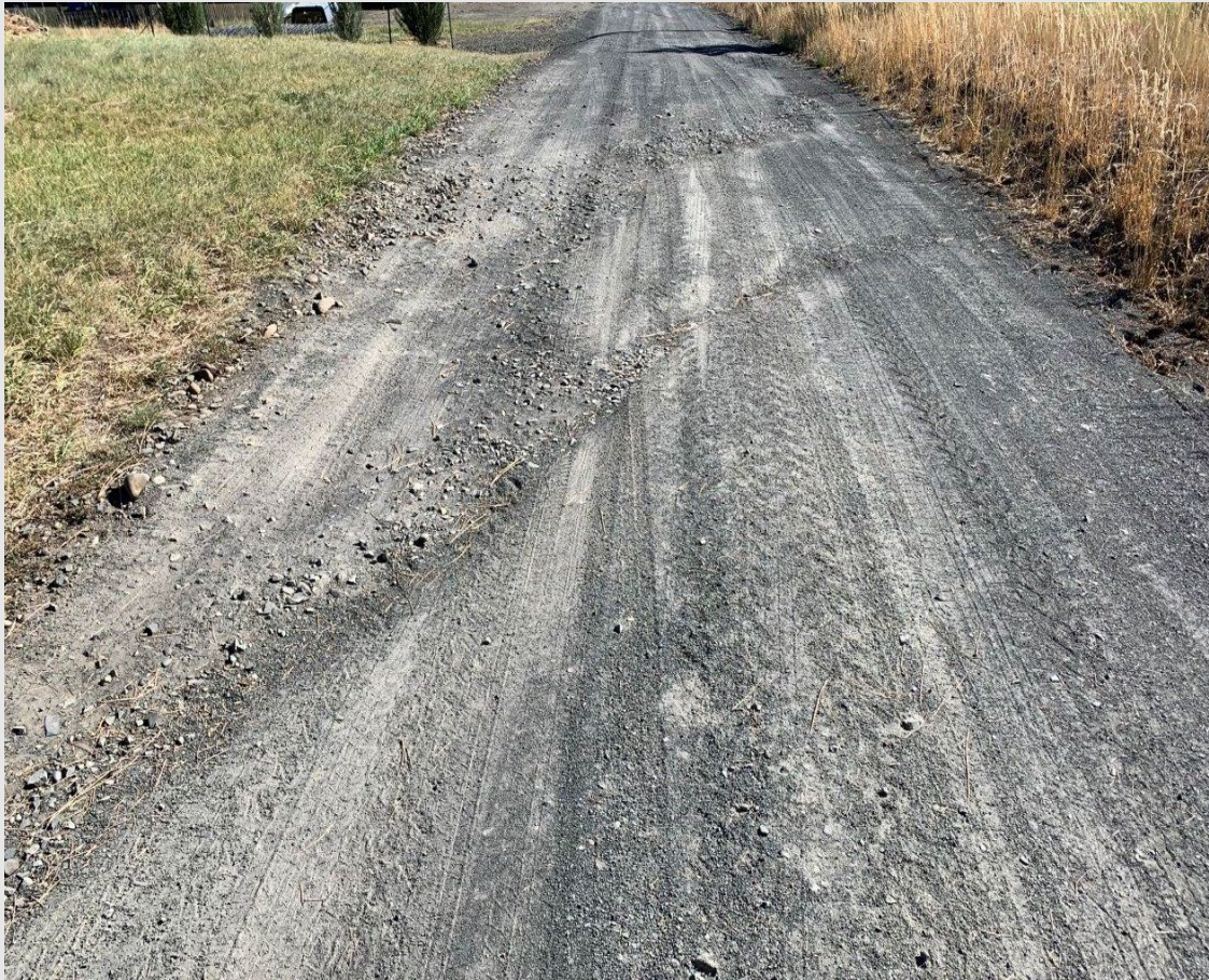
Ukiah, Population 203.