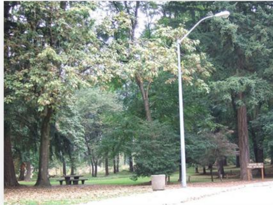
Grove of the States at Baldock Rest Area