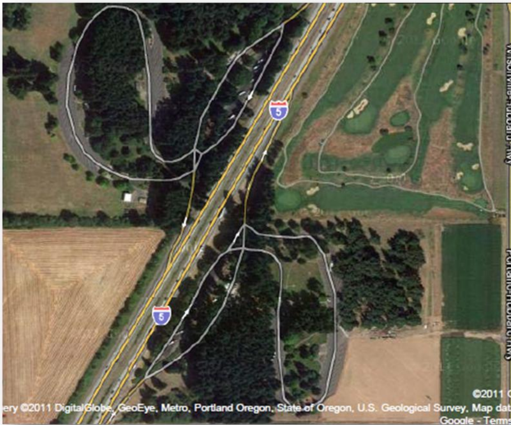
Image of Baldock Rest Area on I-5, Near Wilsonville

The 86-acre Baldock Rest Area, depicted above, consists of two sections of approximately the same size (northbound is 42.54 acres and southbound is 43.43 acres) that fall along either side of I-5 near Wilsonville, Oregon. Constructed in 1966 as part of the Oregon Interstate Highway System, the rest area