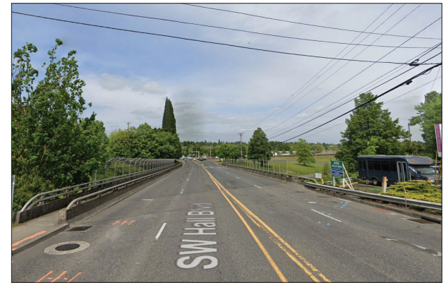
Existing travel conditions on Hall Boulevard over OR217.