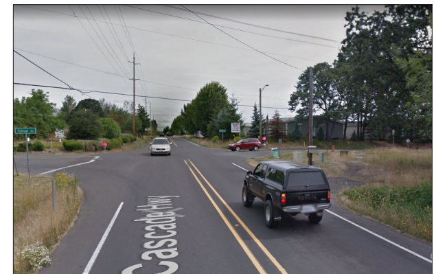
Existing travel conditions on OR213 at Toliver Road.