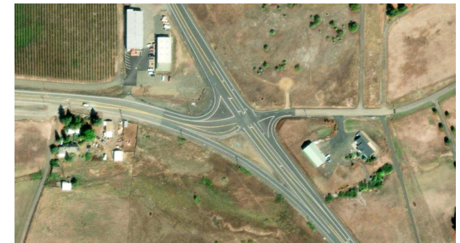
Melrose Road (left) meets Garden Valley Road at a high-speed rural intersection northwest of Roseburg.