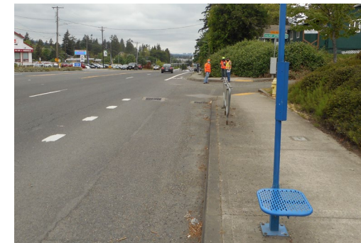
Transit users on OR 99E lack access to safe crossing

This project improves safety and access for people who walk and bike. The area scores in the top 5% of areas with prioritized pedestrian needs and top 10% for bicycle priority needs. This roadway segment has unsignalized, unmarked pedestrian crossings and a history of pedestrian and bicycle crashes.