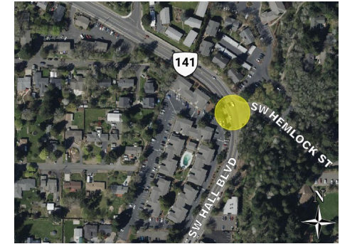
Intersection of Hall Boulevard and Hemlock Street