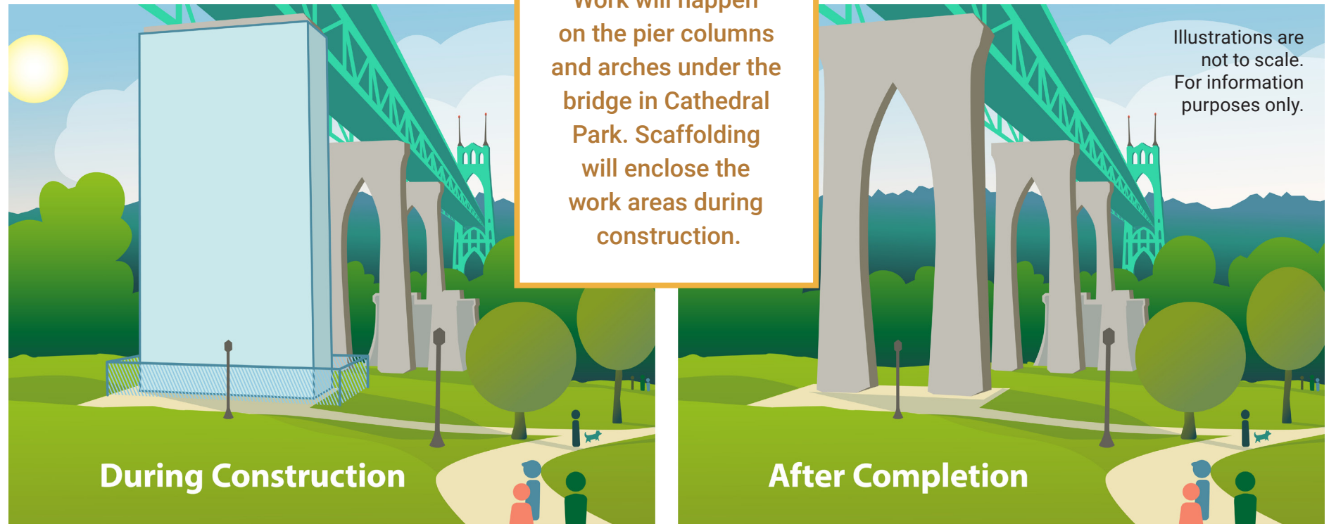
Scaffolding and enclosure examples.