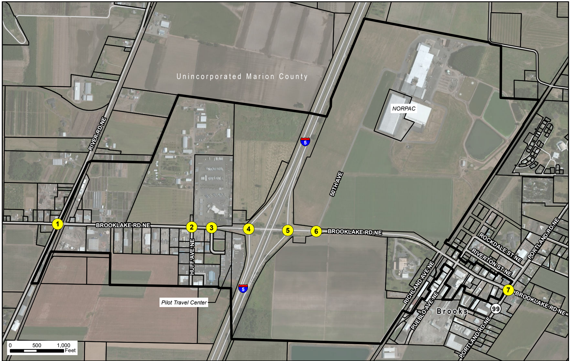
Brooks Interchange Area Management Plan