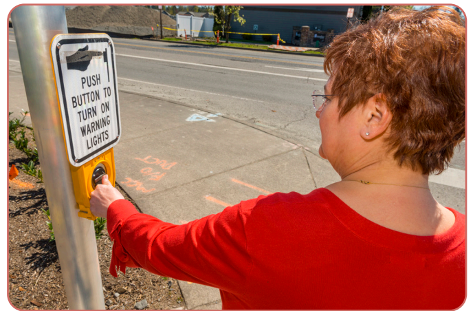
Rectangular rapid flashing beacons like the one seen above are coming to 82nd Avenue at the intersections of NE Pacific Street and SE Mitchell Street.

Work is starting soon and we expect it to be complete in summer 2022.