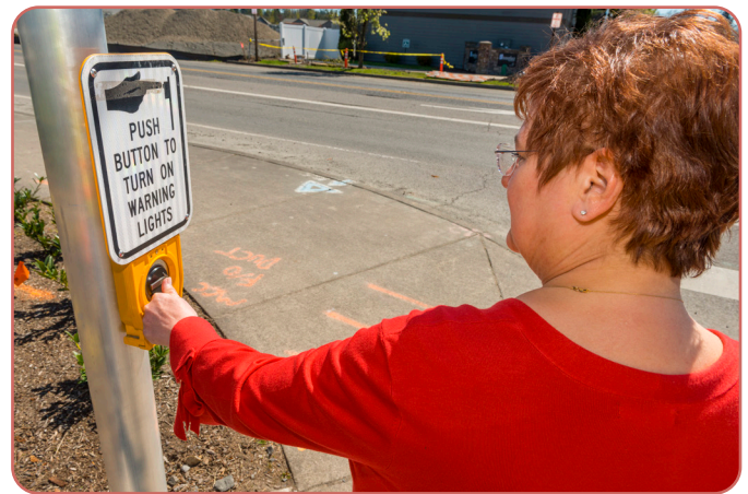
Rectangular rapid flashing beacons like the one seen above are coming to SE McLoughlin Boulevard at the intersections of SE Boardman Avenue and SE Hull Avenue.

Work is starting soon and we expect it to be complete in summer 2022.