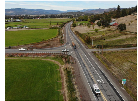
Looking north of the OR 62_234 intersection