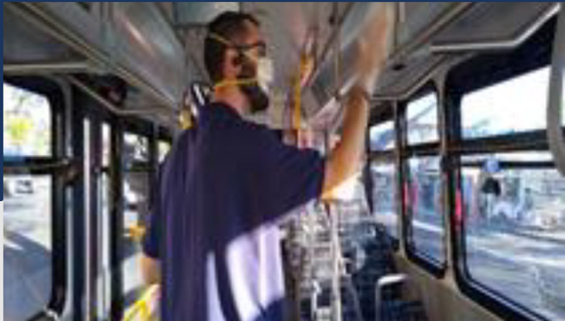
Small Urban Recipients $135K