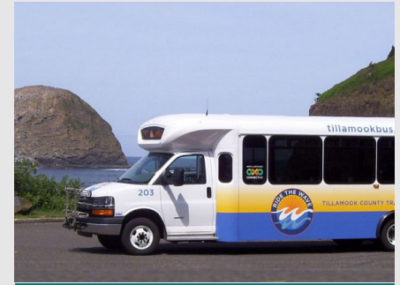
FTA Section 5311