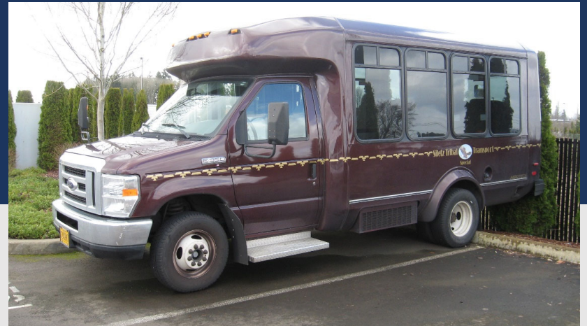
Rural Recipients $166K