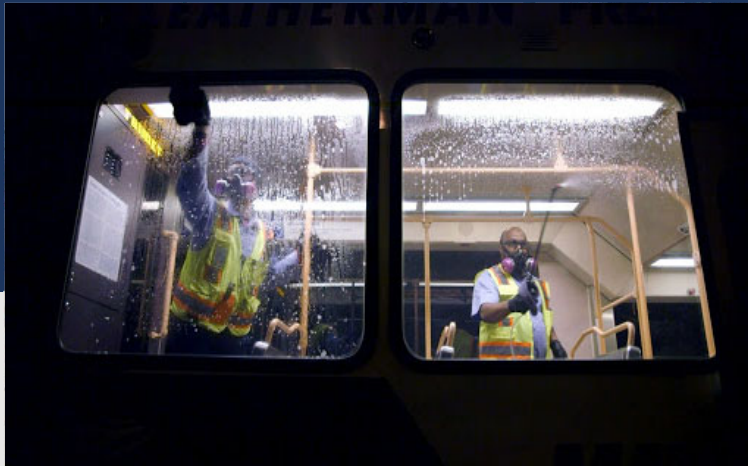
Formula Based Distribution