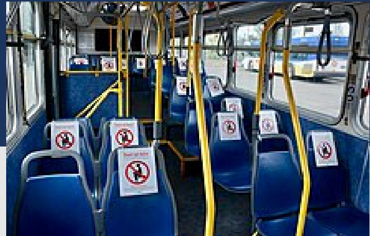
Needs Based Distribution