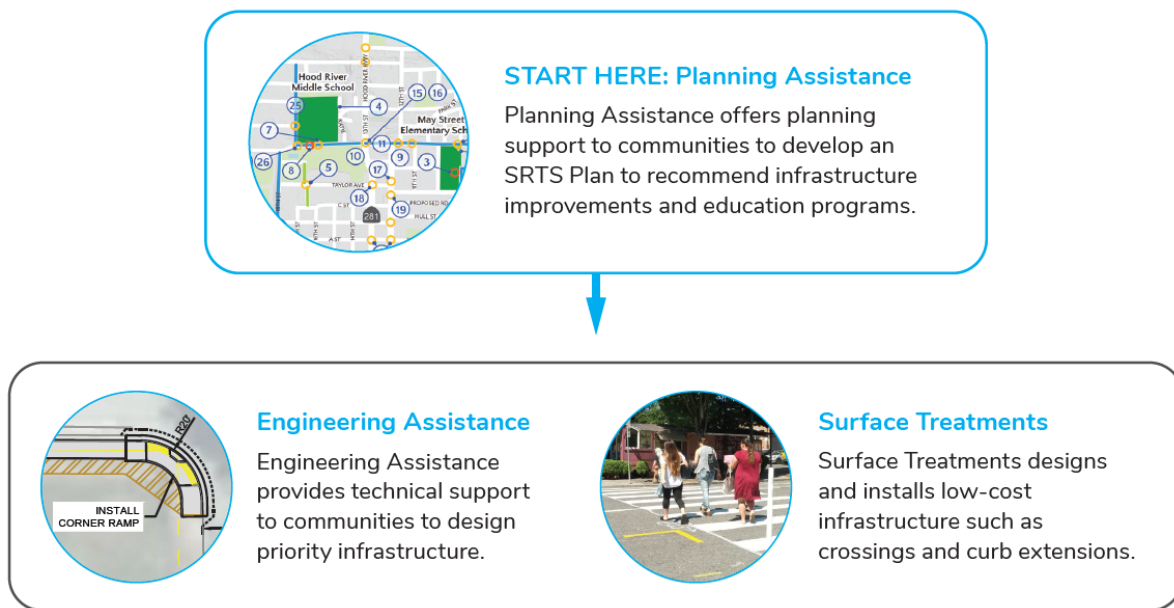
Diagram includes breakdown of three Technical Services; start with Planning Assistance as a first step if you do not have planning capacity or are not ready to apply to the SRTS Competitive Construction grant. Engineering Assistance and Surface Treatments Services available to applicants who have participated in past Planning Services (formerly PIP), or who have had similar public engagement processes for the requested project(s).

All programs help communities plan and build infrastructure that enables students to walk, bike, or roll to school.