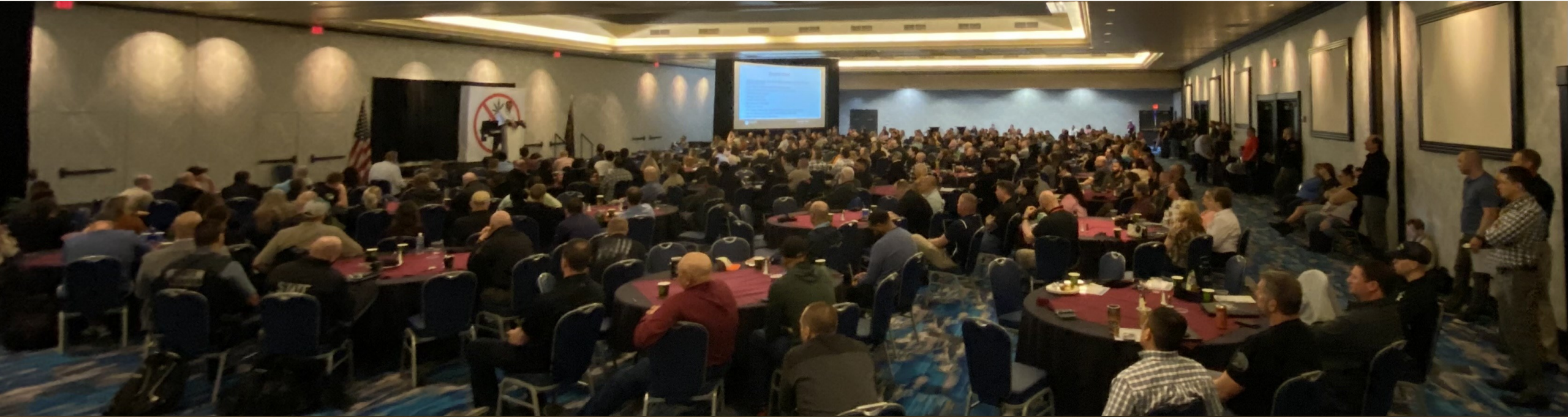
2023 DUII Conference General Session