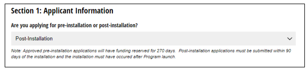
FIGURE 5: POST-INSTALLATION APPLICATION

To apply for a rebate after eligible charging equipment has been installed and activated, Eligible Applicants with an Eligible Location must complete the online application in its entirety and upload <u>all required documents</u> at that time (see Section IV.B for a list of required documents). Note: to ensure the correct application is displayed, please select "post-installation" at the top of the application form, as displayed in Figure 5 below.