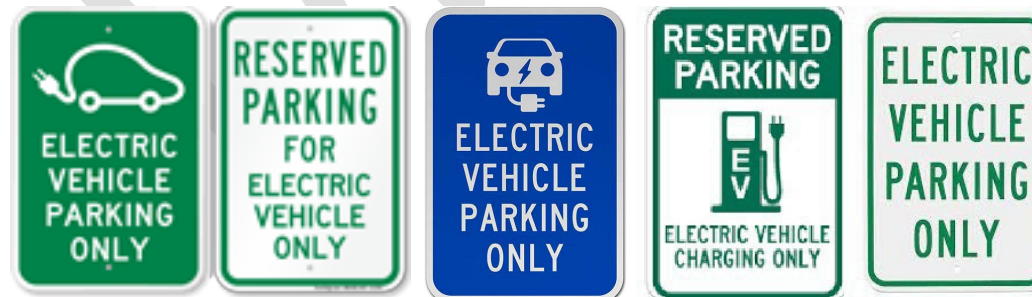
FIGURE 2:EXAMPLES OF ACCEPTABLE "EVCHARGING ONLY" SIGNAGE