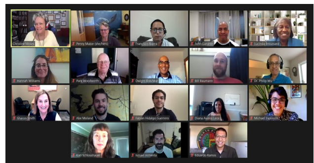
Figure 3 Screen shot of Equity and Mobility Advisory Committee meeting over Zoom

The Equity and Mobility Advisory Committee was convened to advise on the I-5 and I-205 Toll Projects. The Region 1 Area Commission on Transportation, a standing committee that advises the Oregon Transportation Commission, also provides input. Jointly, these two committees include representatives from the community, local governments, business, equity and environmental justice interests, pedestrian and bicycle interests, public transportation providers and users, and highway users. Members of the public are invited to attend via the live stream and provide public comment at committee meetings or by email to the committees.