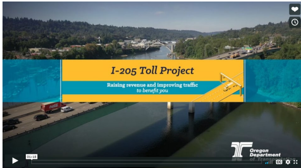
Figure 2 Screen shot of video used in online open house

primary tools for collecting stakeholder and public feedback. The online survey includes multiple choice and write-in responses along with some images and diagrams. The online open house, videos, survey and linked documents are also available in Spanish.