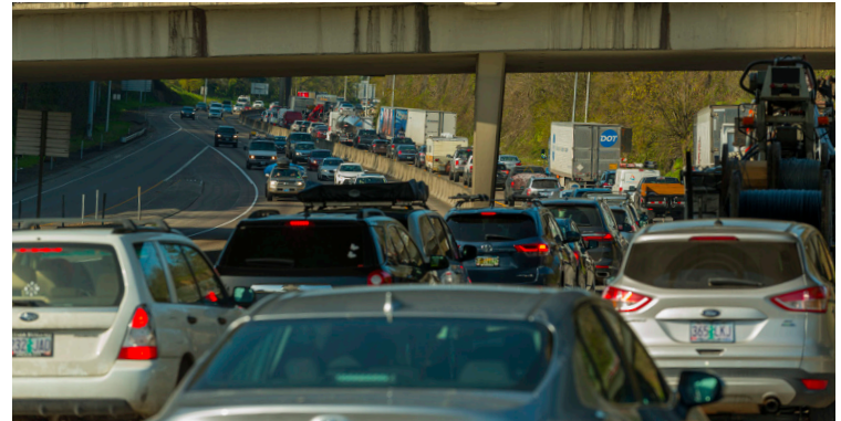
By 2040, Portland-metro households will spend an average of 69 hours each year stuck in traffic on the highways.