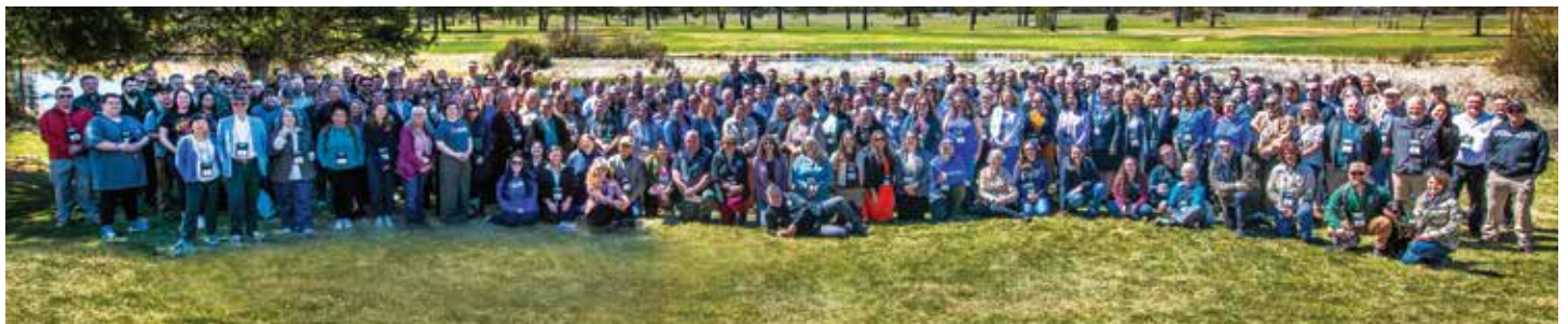
OREGON PREPARED CONFERENCE