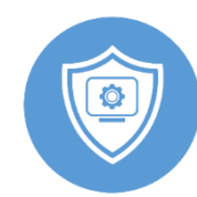
ESF 17 Cyber and Critical Infrastructure Security