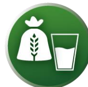
ESF 11 Agriculture, Animals, and Natural Resources