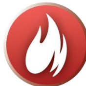
ESF 4 Firefighting