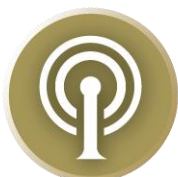
ESF 2 Communications