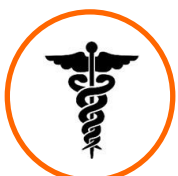
ESF 8 Health and Medical