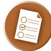
ESF 5 Information and Planning