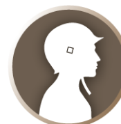
ESF 18 Military Support