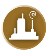
ESF 14 Business and Industry