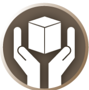
ESF 16 Volunteers and Donations