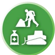
ESF 7 Logistics Management and Resource Support