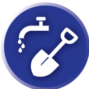
ESF 3 Public Works