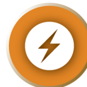
ESF 12 Energy