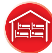
ESF 6 Mass Care