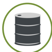
ESF 10 Hazardous Materials