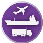
ESF 1 Transportation