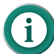
ESF 15 Public Information