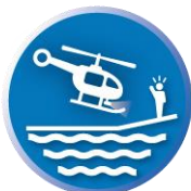
ESF 9 Search and Rescue