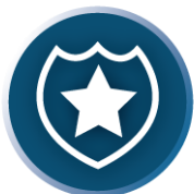
ESF 13 Public Safety and Security