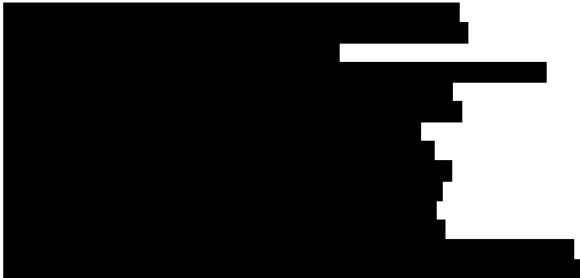
Exhibit 26 – PacificSource LH Agreements