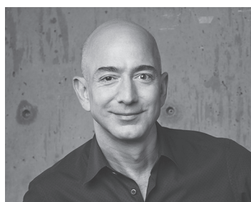
Jeffrey P. Bezos Founder and Executive Chair of Amazon