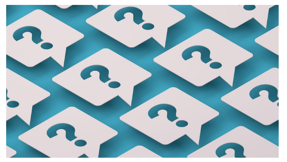
Cost and access to funding