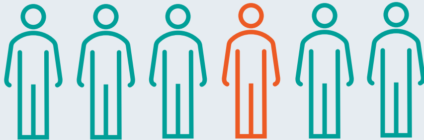
Percent of Screened Medicaid Members with Transportation Needs (N=24,828)