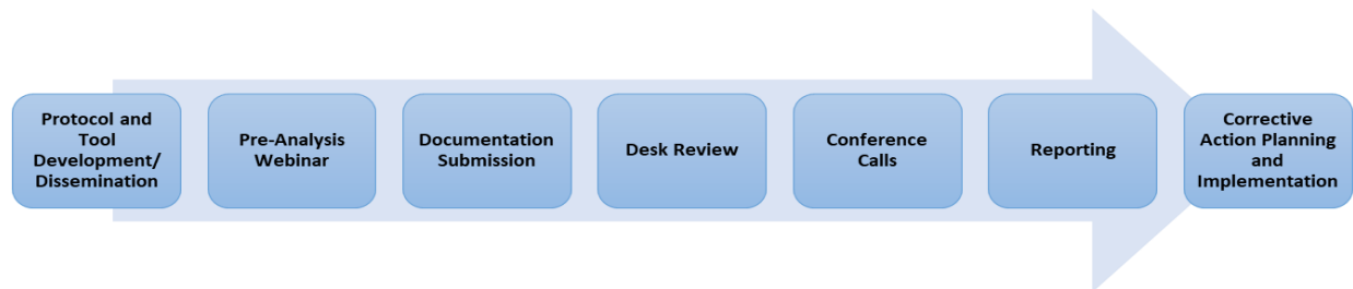
Figure 2-1—2020 MHP Analysis Activities

The 2020 MHP Analysis activities are illustrated in Figure 2-1 and described below.