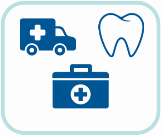
CCOs use that revenue to deliver, manage and provide physical, behavioral, dental and transportation services to their membership