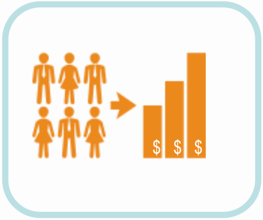
Monthly capitation rates are paid to CCOs based on their membership characteristics (i.e. age, income, etc.)

CCOs are paid primarily by monthly capitation rates developed prospectively