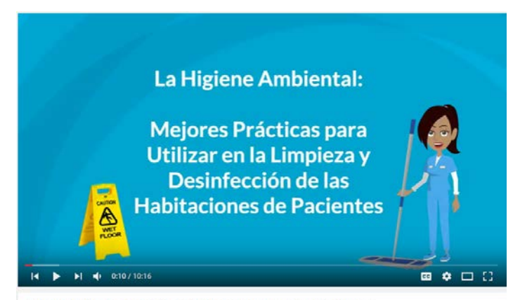
Higiene Ambiental: Las Mejores Prácticas para Limpiar y Desinfectar Habitaciones de Pacientes