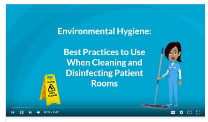
Environmental Hygiene: Best Practices to Use When Cleaning and Disinfecting Patient Rooms