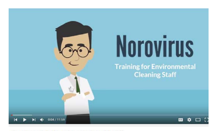
Norovirus: Training for Environmental Cleaning Staff