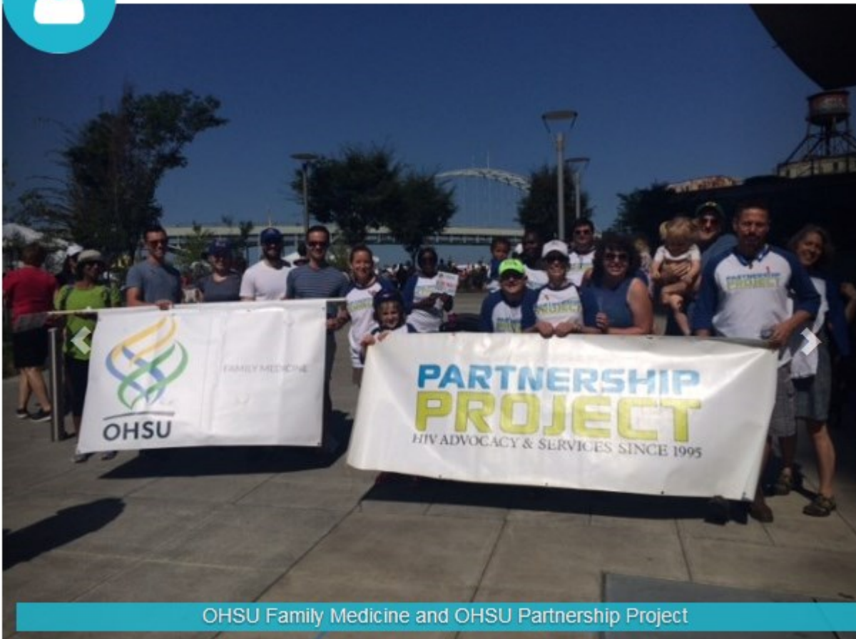
OHSU Family Medicine and OHSU Partnership Project