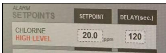
Figure 1. High chlorine level alarm set at 20 ppm (very high)

Take the time to test the alarms to make sure they work. Figure 2 shows the set point for a surface water filtration plant at 0.15 NTU. The alarm was tested during a survey in 2016 by lifting the turbidimeter head off the sensor body to create an 8 NTU “spike” in turbidity. The alarm worked, but the test revealed that the SCADA system was incapable of recording higher than 1 NTU due to how the 4-20 milliamp (mA) input was configured in the Programmable Logic Controller (PLC).