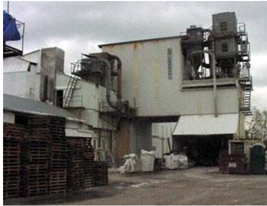
Figure 3 Former Vermiculite Unloading Area (April 2000)