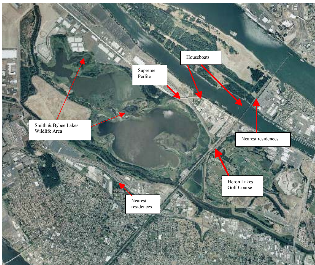
Figure 2 - Supreme Perlite vicinity

Supreme Perlite, managed by the current owner since the mid-1970s, was previously owned by his parents (now deceased) who purchased the plant in the early 1960s. According to the owner, there were 3 full-time employees (including the owner’s father) and a few part-time factory employees (generally seasonal and varying in number according to product demand) who worked at the plant during the years Libby vermiculite was processed at the plant. According to the owner, one of the employees who worked at Supreme Perlite for 34 years, and was reportedly a heavy smoker, died of lung cancer two years after retiring in 1988. Vermiculite was processed in the western section of the plant, and perlite in the eastern section. The same employees worked in both sections of the plant,