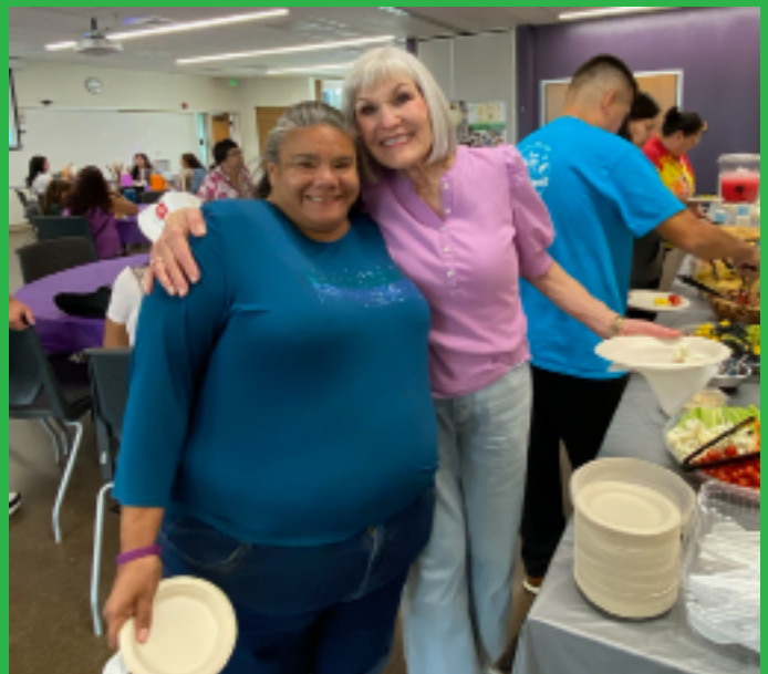
WIC 50th anniversary community events. Clockwise from top right Clackamas County, Linn County, the Confederated Tribes of Umatilla, Jefferson County and Benton County.