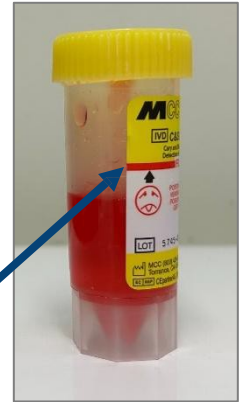
Sample container with liquid and fill line