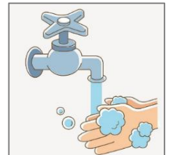
Wash hands well with soap and water