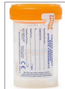
Example of a sample container