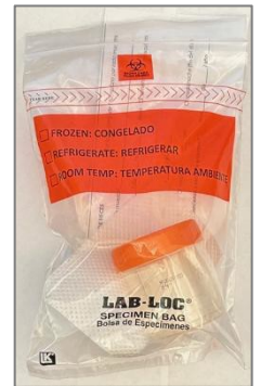
Sample in Biohazard bag