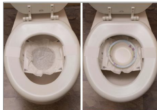
Toilet liner by itself