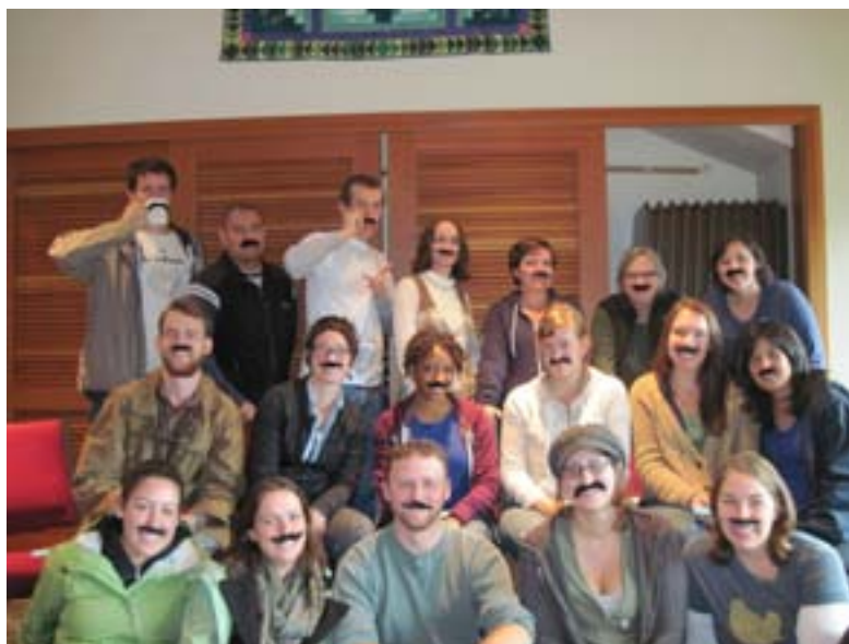
This year’s well-disguised VISTA team.