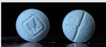
Authentic oxycodone M30 tablets