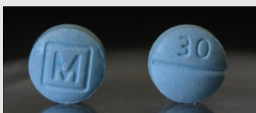
*Counterfeit oxycodone M30 tablets containing fentanyl