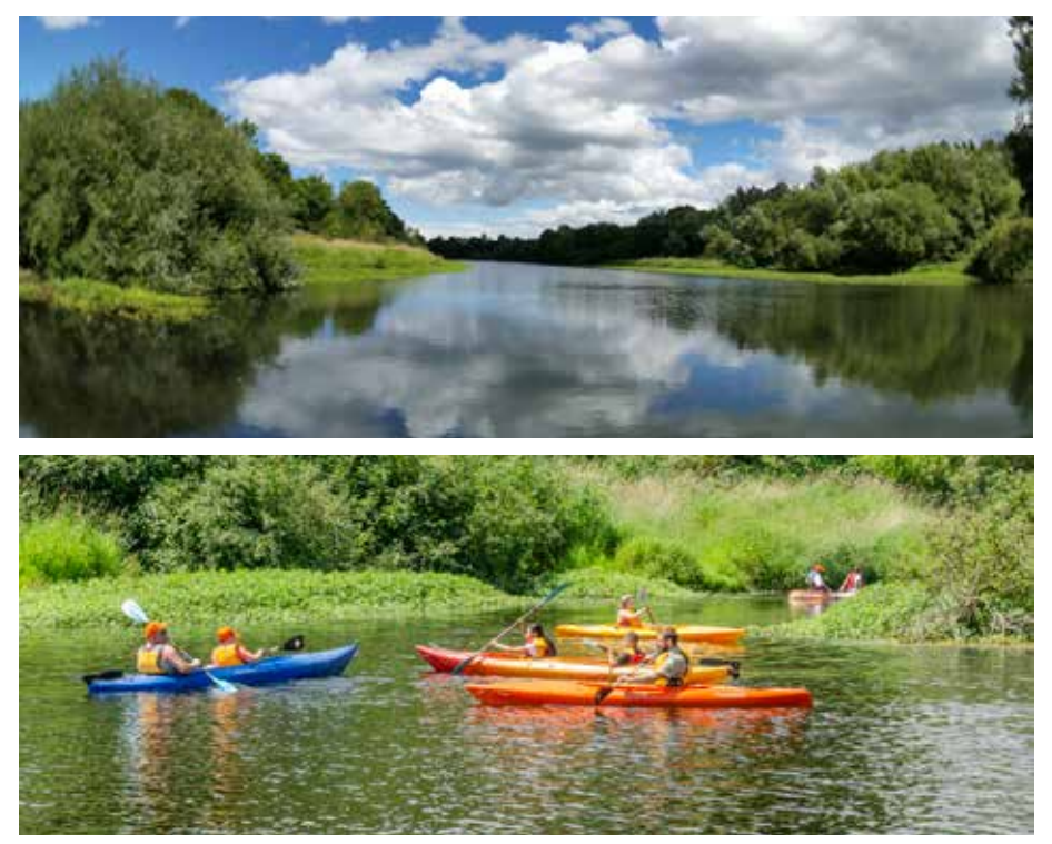
Preservation and recreation: The inherent tension between recreation and preservation has existed since day one at Parks. Leaders from Boardman forward have grappled with the mission.

jurisdiction of the Highway Department had been the perceived stability of the gas tax. Parks seemed prized by the public but vulnerable to cutbacks in times of economic stress. The assumption had been that gas revenues would be comparatively more reliable, as they had been during the Great Depression. But with gas prices at the center of the current crisis, gas taxes faced new scrutiny and protest. The main source of funding for Oregon State Parks and Recreation seemed like it might sputter out, just as the visitor boom that had propelled the breakneck pace of the 1960s flattened and fell. As lines for gasoline grew, state park use dropped by a third, and was still significantly below previous years by 1974. Although there remained "sufficient funds for the basic program," the acquisition goals that had been the agreed-upon focus began to idle. Visitor numbers would recover and reach all-time highs by the late 1970s. The budget would not.<sup>212</sup>