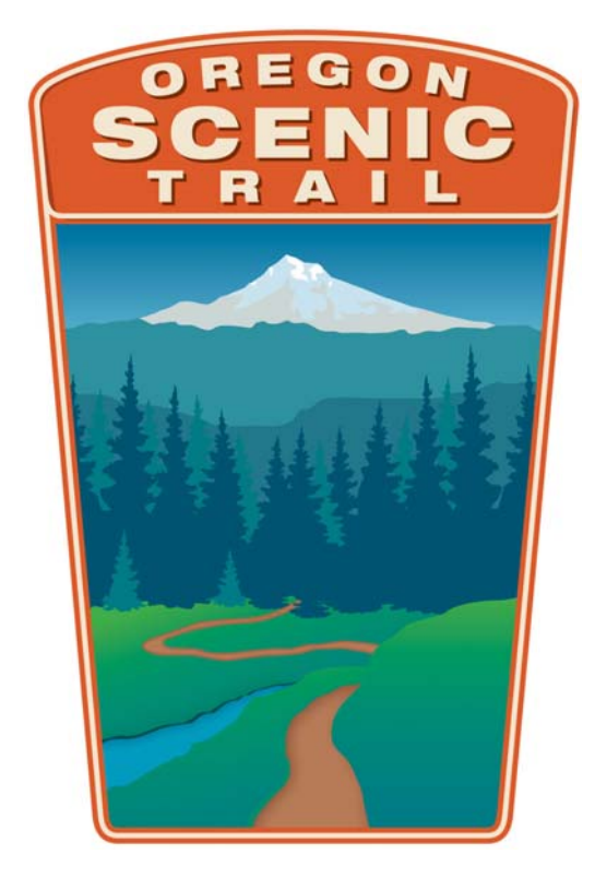
Oregon Scenic Trails