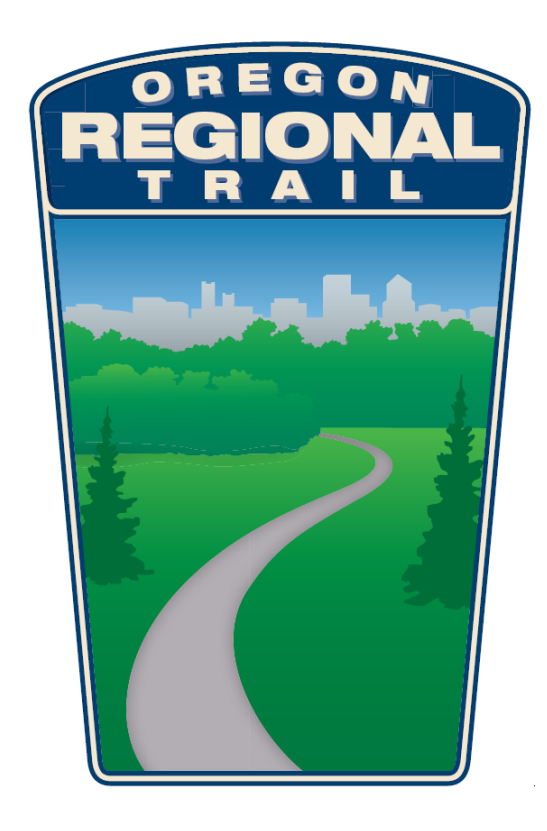
Oregon Regional Trails