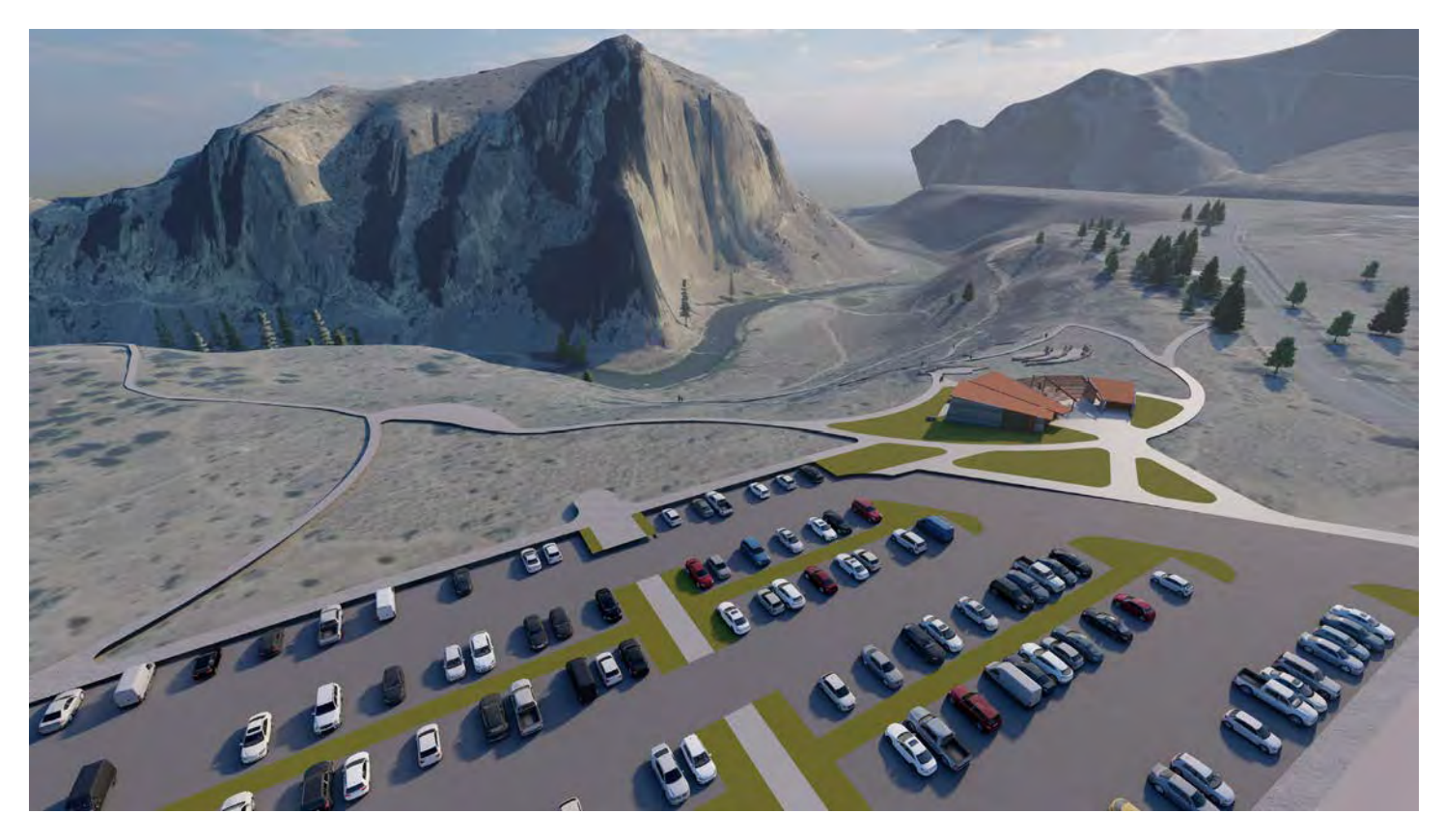
Figure 20: Welcome Center Perspective

Expand and reconfigure existing parking lot to accommodate D1 approximately 215 spaces (200 standard, 8 ADA, 7 RV) D2 Construct a new 2,500 square foot Welcome Center and restrooms Improve the Rimrock Trail with accessible seating, viewpoints and D3 interpretive elements Improve trailhead and accessible trail circulation throughout the D4 focus area Develop comprehensive wayfinding and interpretive plan for this D5 high-use area D6 Construct a new accessible amphitheater D7 Upgrade utilities, including potable water, electric service, and sanitary drainfield Restore habitat within parking lot islands, along the roadway, and in D8 areas disturbed by construction