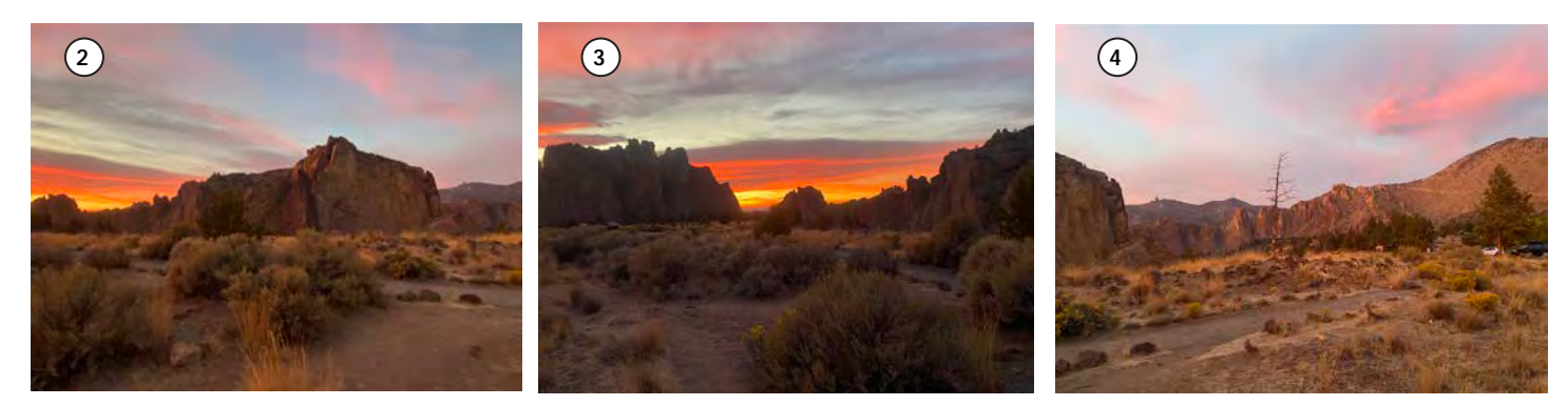
Figure 19: Welcome Center Viewshed