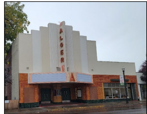
Alger Theatre, Lakeview Before (top) and After (bottom)