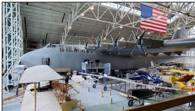
Hughes Flying Boat Evergreen Aviation & Space Museum

The H-4 Hercules, also known as the "Spruce Goose," is nationally significant for its association with Howard R. Hughes, Jr., a pivotal figure in American aviation, and for serving as a research platform for innovative systems later standardized in large aircraft. This one-of-a-kind prototype flew only once, on November 2, 1947, and was used from 1947 to 1953 to test aviation innovations like Duramold wood composite construction and redundant fire suppression and flight control systems. It remains the largest seaplane, wooden aircraft, and propeller-driven plane ever built. After its flight, the plane was housed in Long Beach, California, until 1992, when it was disassembled and moved to McMinnville. Listed in the National Register in 1980, the National Park Service delisted the aircraft after it was moved without the agency's approval. Reassembled in 2001, it now serves as the centerpiece of the Evergreen Aviation & Space Museum and is the only individually-listed aircraft in Oregon.