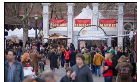
The Portland Saturday Market is recognized as the largest continuously operating open-air arts and crafts market in the country