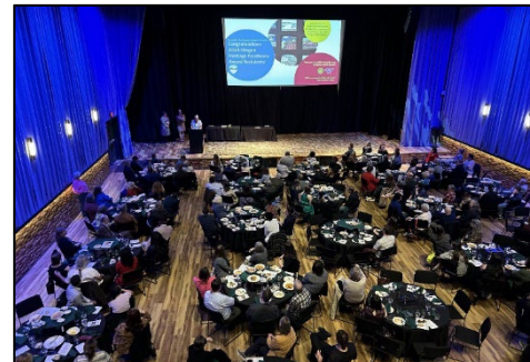
Oregon Heritage Awards Dinner and Presentation at the 2024 Oregon Heritage Conference