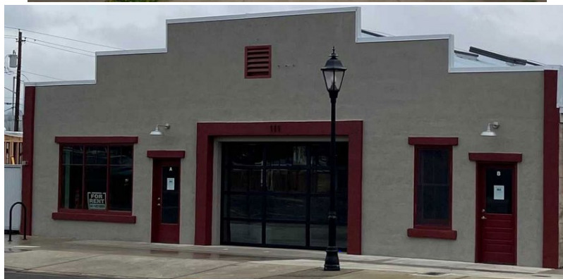
Malmgren Garage, Talent 2022 Project. Restoration the historic building following the Almeda fire.