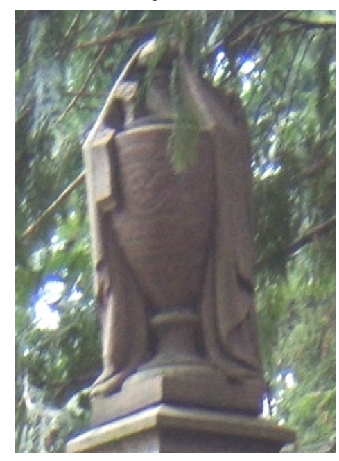
URN WITH FLAME

Soul departing; eternal vigilance, remembrance