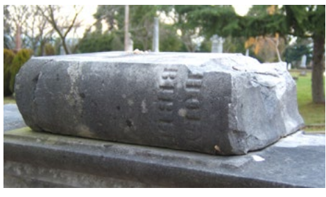
STACK OF BOOKS Scholarly, educated.