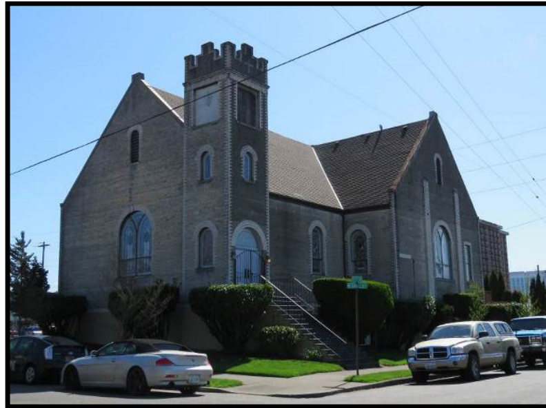
Mt. Olivet Baptist Church, Portland