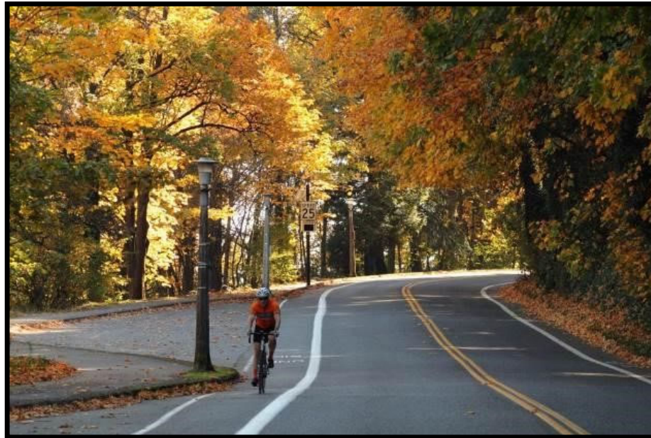
Terwilliger Parkway, Portland