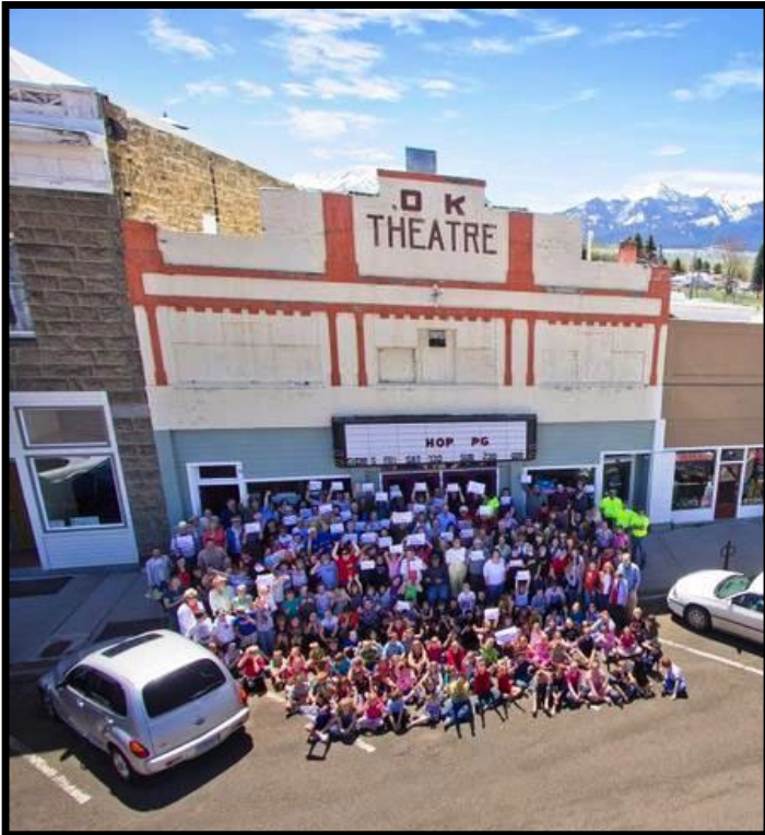
O.K. Theatre, Enterprise, Wallowa Co.