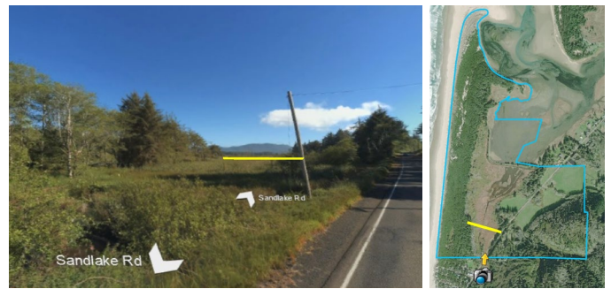
VIEW FROM SANDLAKE ROAD, NORTH OF TIERRA DEL MAR