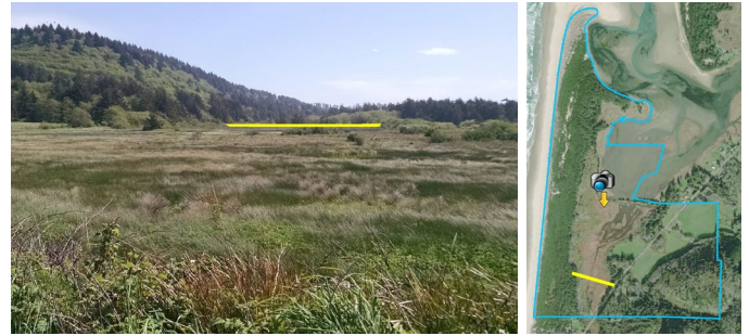
VIEW OF PROPOSED SETBACK DIKE HEIGHT FROM EXISTING LOCATION

Yes, OPRD and Tillamook Estuaries Partnership will share designs and seek comments from the public. Tillamook Estuaries Partnership is the lead in managing the design contract and will likely be the lead in construction and planning. OPRD, as landowner, will guide the process. A technical team of diverse representatives from agencies, tribes, and the local community will meet to discuss and contribute to design refinement. We will hold public town hall meetings to gather feedback at regular intervals through the design processes.