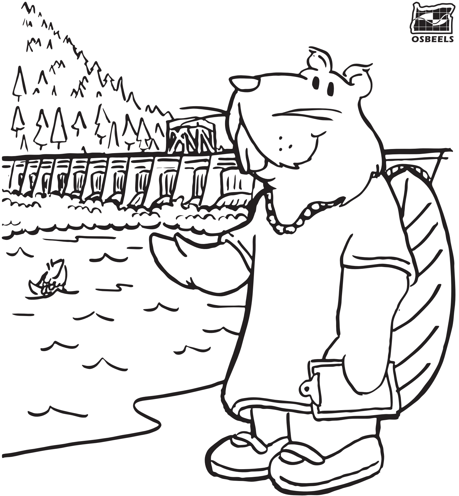
WINNIE THE WATER RIGHT EXAMINER INSPECTS A RIVERBANK NEAR THE BONNEVILLE DAM IN OREGON