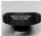
1.5 F NH X 1 M NH Part #: 369-1521024