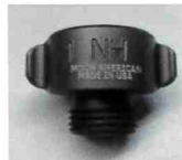
1 F NH X .75 M GH Part #: 369-1020754