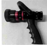
1" NH SELECT GALL NOZZLE 13-60 GPM Part #: 512P-10214