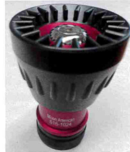
1 in Combo Nozzle 10 - 24 Part #: 516-1024