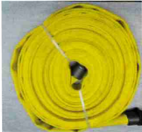
1 1/2 IN FORESTRY HOSE (TYPE 2) 1.5 X 100 YELL NH AL Part #: 1125-1531007