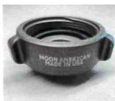
2.5 F NH X 1.5 M NH Part #: 369-2521524