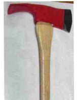
PULASKI Part#: 881-3635