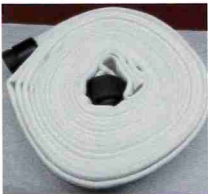
3IN STRUCTURAL HOSE 3 X 50 DJ 800# WHITE W/ 2.5 NH AL Part #: 1129-308050254