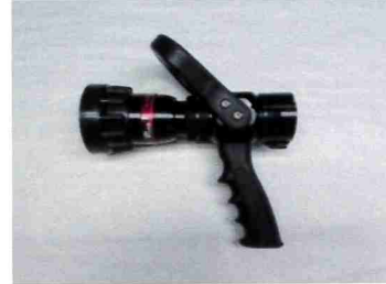
1.5 NH Automatic Nozzle 60-125 GPM Part #: 537P-15214