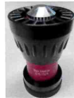
1 1/2 COMBO NOZZLE 20-60 GPM Part #: 516-1524