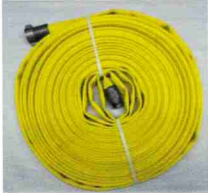
1 IN FORESTRY HOSE (TYPE 2) 1 X 100 YELL NH AL Part #: 1125-1031007