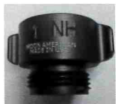
1 F NH X 1 M NPSH Part #: 369-1021014