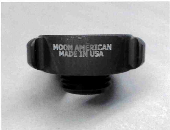
1.5 F NH x 1 M NH Part #: 369-1521024