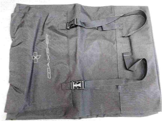
Bag Part #: 1399-221869