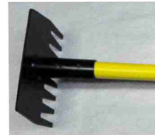
MCLEOD Part#: 888-505