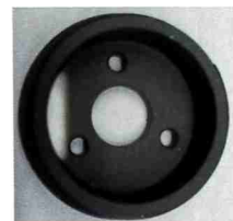
MOUNTING BRACKET Part#: 861-2524