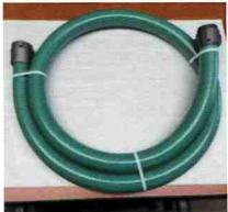
HOSE 2"X8' HARD SUCTION WITH 2" NH AL COUP Part #: 1139-2010084