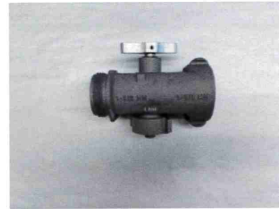
Inline "T" 1.5 NH x 1" NH w/ Shutoff Part #: 427-15210294