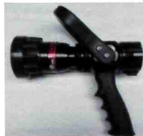
1.5 NH AUTOMATIC NOZZLE 60-125 GPM Part #: 537P-15214