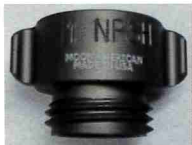
1 F NPSH X 1 M NH Part #: 369-1011024