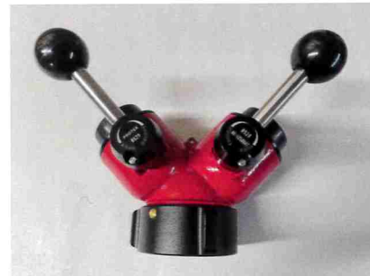
Gated Wye 2.5 F NH X (2) 1.5 M NH Part #: 430-2521524