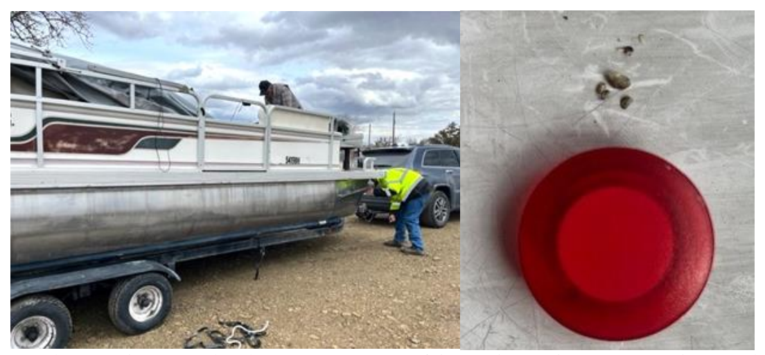
Figure 2 and 3. Boat intercepted at the ODFW's watercraft inspection stations. Boat was inspected and quagga mussels found. ODFW decontaminated the boat on-site and re-inspected with no additional mussels found.

During the inspection process, if an inspector observes a vessel to be contaminated with any aquatic invasive species, a decontamination is immediately performed on-site. Three hundred and thirty-six of the vessels inspected were contaminated with aquatic vegetation, marine or freshwater organisms, or other biofoulings. We were able to perform a simple decontamination on these vessels. Nine vessels were contaminated with quagga or zebra mussels, and we performed a full decontamination (hand removal, followed by hot water high-pressure) on-site (Figure 2 and 3). These vessels originated from Arizona, Nevada, and Texas. If the vessel was remaining in Oregon, a follow-up inspection/decontamination was performed at the owner's residence before the vessel was launched, or if the watercraft was going to another state, that other state was notified, and another inspection may have been performed.