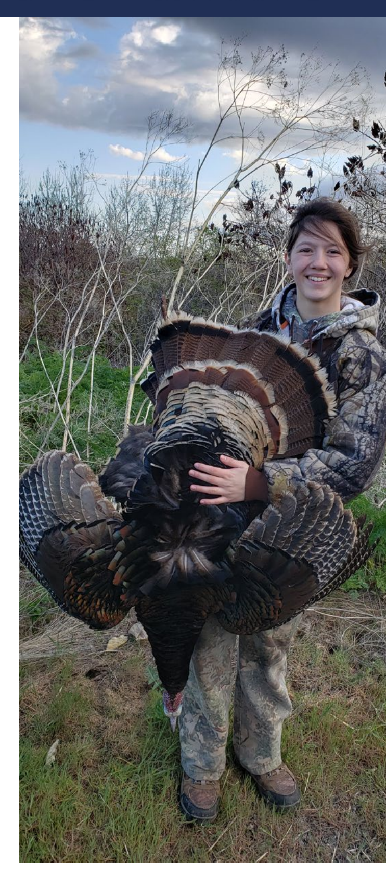
A Fish and Wildlife Trooper was checking turkey hunters on the youth weekend and contacted the juvenile hunter depicted above, who shot her first turkey in the Ukiah Unit.

A Springfield Fish and Wildlife Trooper received a call regarding a neighbor possibly shooting deer in an orchard. The Trooper received a picture that depicted a dead deer that was up against her neighbor's fence. Just prior to Troopers arriving, the reporting party called and reported another gunshot. Troopers arrived and observed a male on an ATV carrying a lever action rifle. Ultimately, the investigation revealed that the subject shot and killed two deer on the property. The subject's orchard was fenced in with a deer proof fence, however, a tenant of the property left a gate open allowing four deer to sneak in during the night. The subject didn't know how else to remove the deer and decided to shoot them. The subject was issued a citation for two counts of Unlawful Take of a Game Mammal Closed Season. Troopers recovered the two deer from the property and donated them through a charity organization. The subject was also given contact information about how to contact ODFW and apply for damage kill permits.