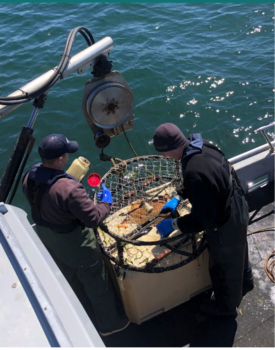
Troopers pull and examine crab pots on a recent boat patrol.